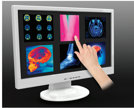
Stand shown for display purposes only