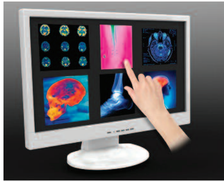
Stand shown for display purposes only