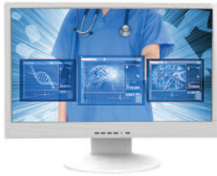
Stand shown for display purposes only