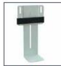
Waste Basket Holder