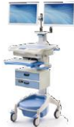
AccessPoint™ Dual Monitor