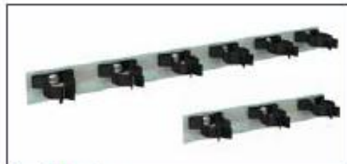
Hose Clip Organizers