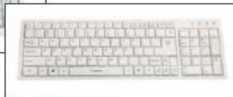
Ultra-Slim Keyboard Options