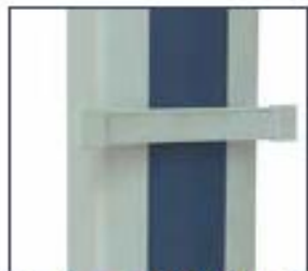
Rear Accessory Bar (8", 14", 18")