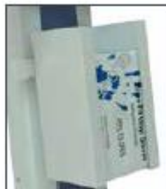
Glove Box Holder