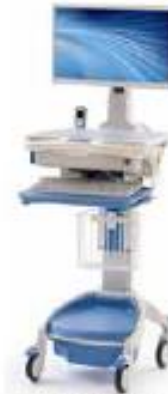
AccessPoint™ Swappable Power