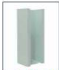
Glove Box Holder (2-box)