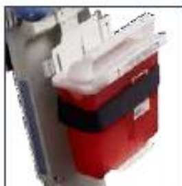
Standard Sharps Holder

360° of versatility and efficiency. Our new AccessPoint™ is equipped with the ability to accommodate multiple accessories at multiple mounting points for maximum convenience and holding capacity.