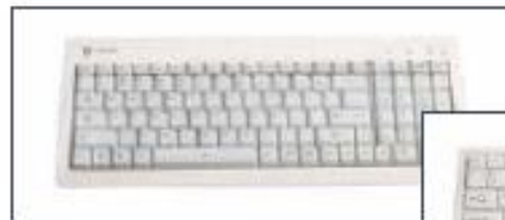
Backlit Keyboard Options