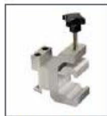
Pole Holder for 1" Pole