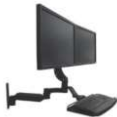
UL180P-W3-KUB-AS1 Ultra 180 shown with Dual Monitors, Flip Up Keyboard Tray, and AS1 extension mounted at the front of the arm.