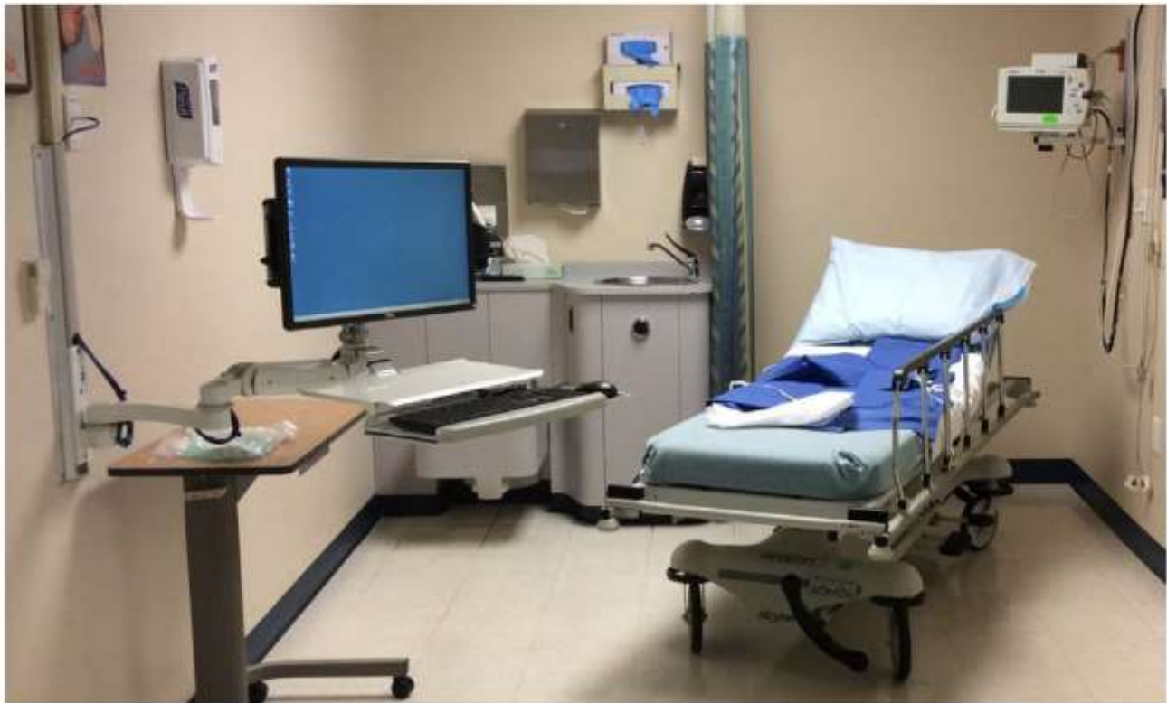
The Ultra arm is protected by U.S. Patent 9,243,743