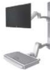
DUAL ULTRA 180 WORKSTATION Monitor and WorkSurface Tray mounted on separate Ultra 180 arms with A1 extensions.