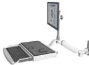
UL180EV7-W3-KUW-A1 Ultra 180 shown with WorkSurface Tray and A1 extension mounted at the back of the arm.