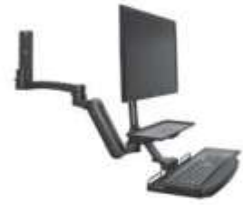
UL180iEV7-W3-KUB-A1 Inverted Ultra 180 shown with Flip Up Keyboard Tray and Service Tray with A1 extension mounted at the back of the arm.